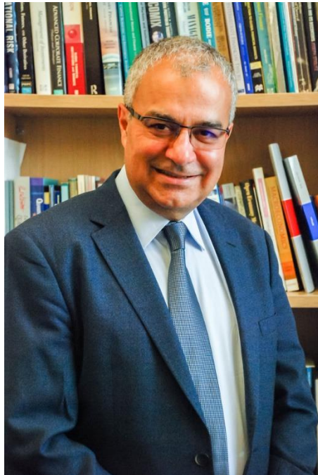
Professor Panicos Demetriades Former Governor Central Bank of Cyprus