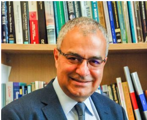
Professor Panicos Demetriades Former Governor Central Bank of Cyprus