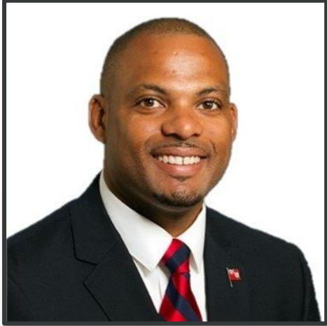
The Hon. Jason Hayward, JP, MP Minister of Economy and Labour Bermuda Parliament