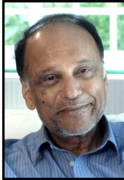
Professor Partha Dasgupta